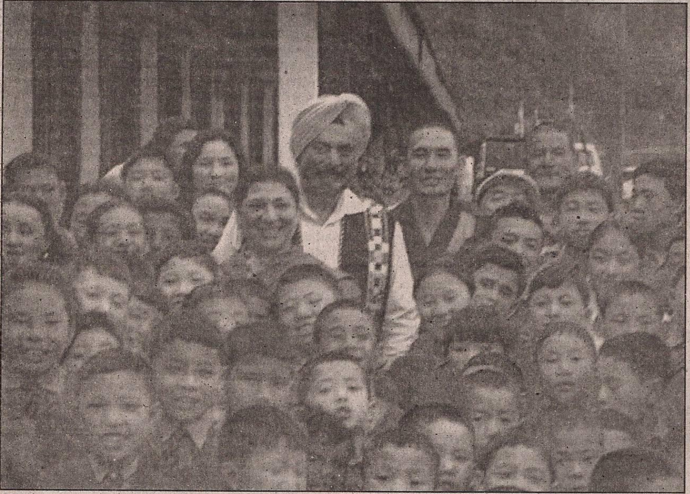
Governor with students of Manjushree Vidyapith

From P.I. In the afternoon of the 15 th , the governor visited the Manjushree Vidyapith orphanage here and be-